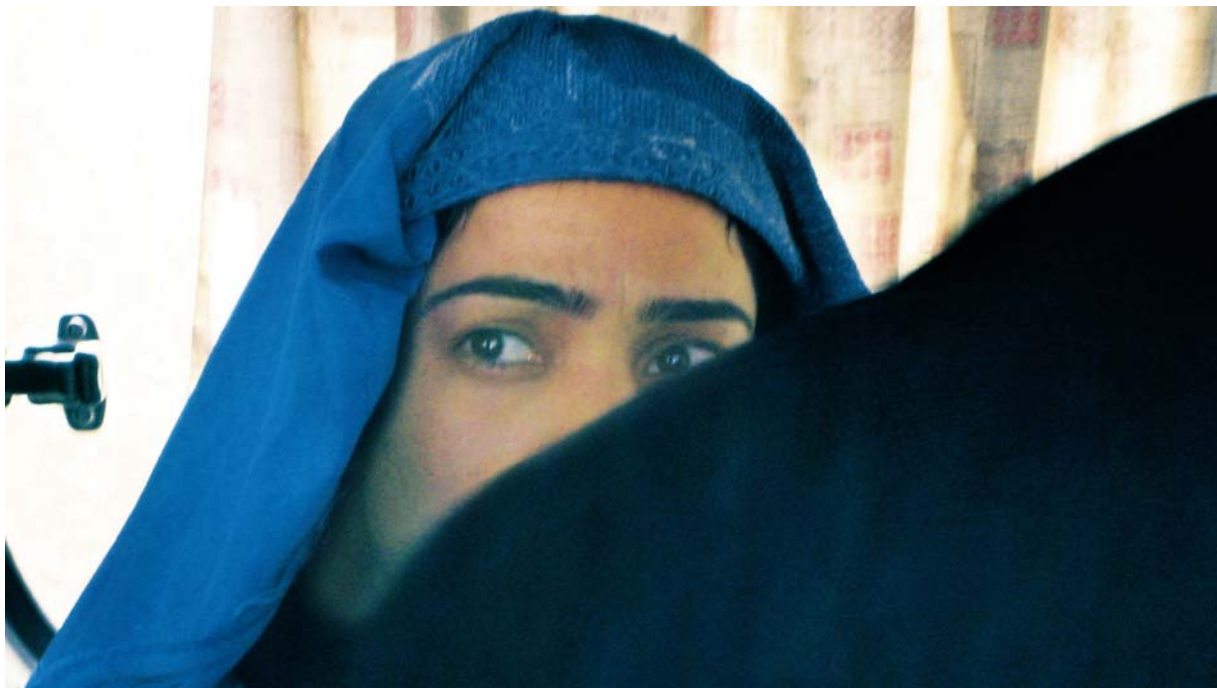
Enemies of Happiness , Courtesy of Women Make Movies, www.wmm.com .