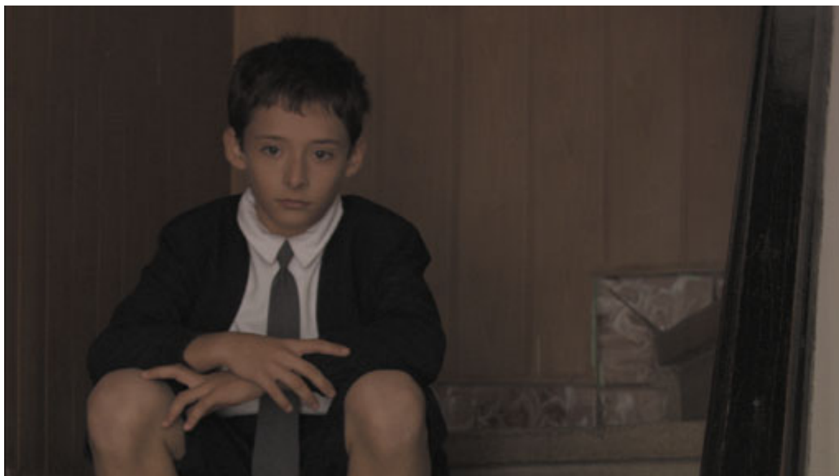
Antes y después de besar a María

Antes y después de besar a María/Before and After Kissing Maria (2007)