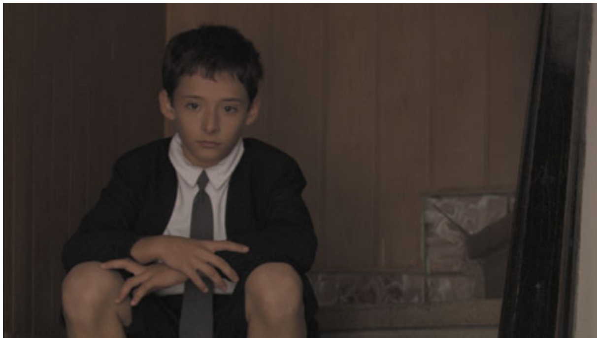
Antes y después de besar a María

Antes y después de besar a María/Before and After Kissing Maria (2007)