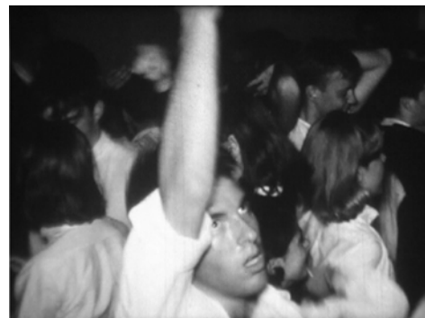
Sixties Teen Dance Party

A provocation about violence, media, and reality. Maryland premiere.