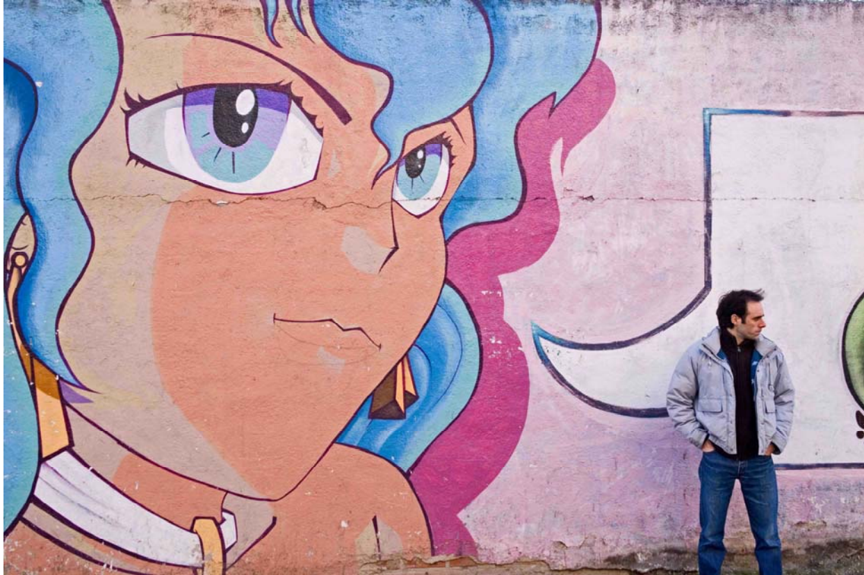
El Canto del Grillo

El Canto del Grillo/The Song of the Grasshopper (2006)