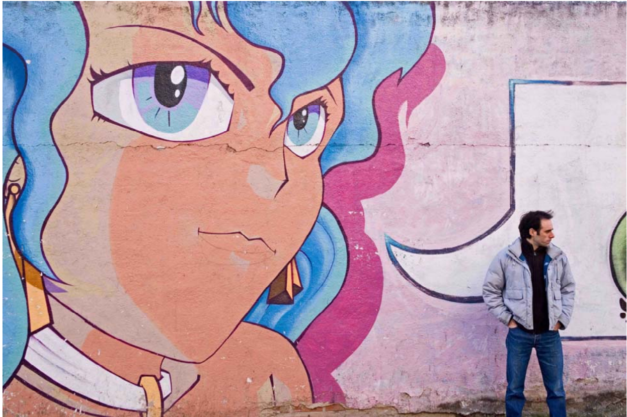
El Canto del Grillo

El Canto del Grillo/The Song of the Grasshopper (2006)