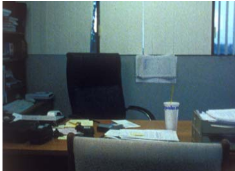
The Blood of the Earthworm

Saturday, November 17, 2007 8:30 pm Displeasure (75 min.) VIEWER DISCRETION ADVISED